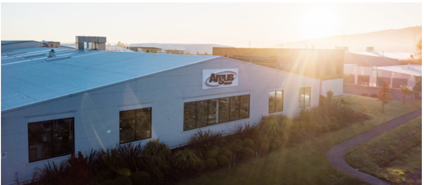
Argus ManuTech HQ

A prototype test solution was designed and implemented but it was unsuitable for full production due to several issues, including non-intuitive operation for production staff, a lack of adaptability to process changes, and insufficient guarding. Additionally, the associated electrical safety tester did not possess the required data