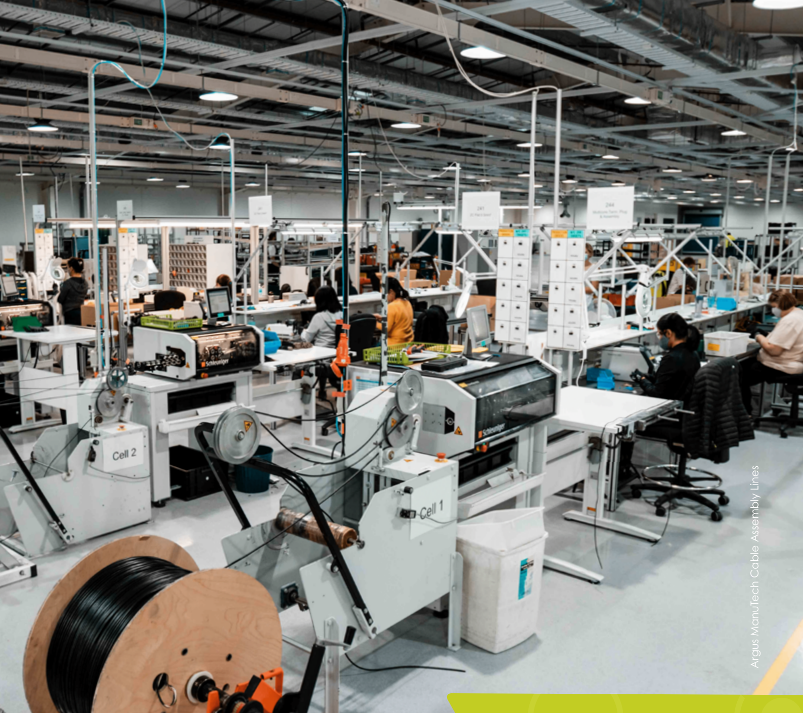
Argus ManuTech Cable Assembly Lines